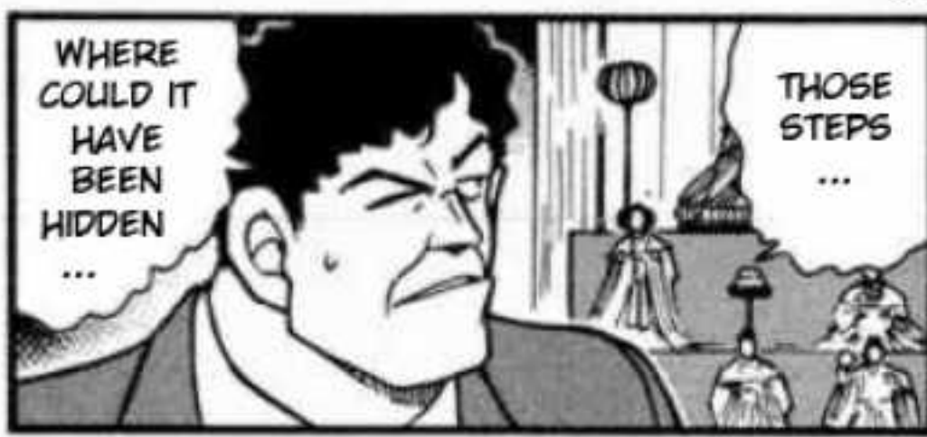
sfx: pa (light shining on the interior)