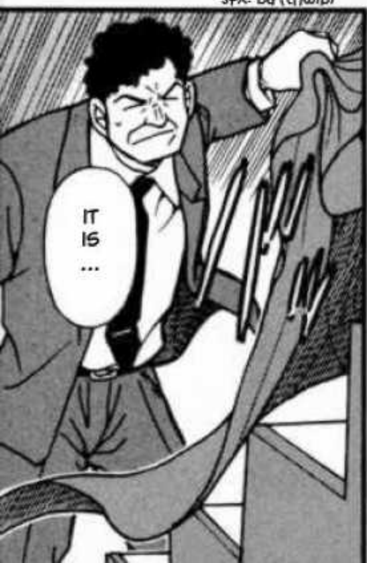
sfx: ba (tshwip)