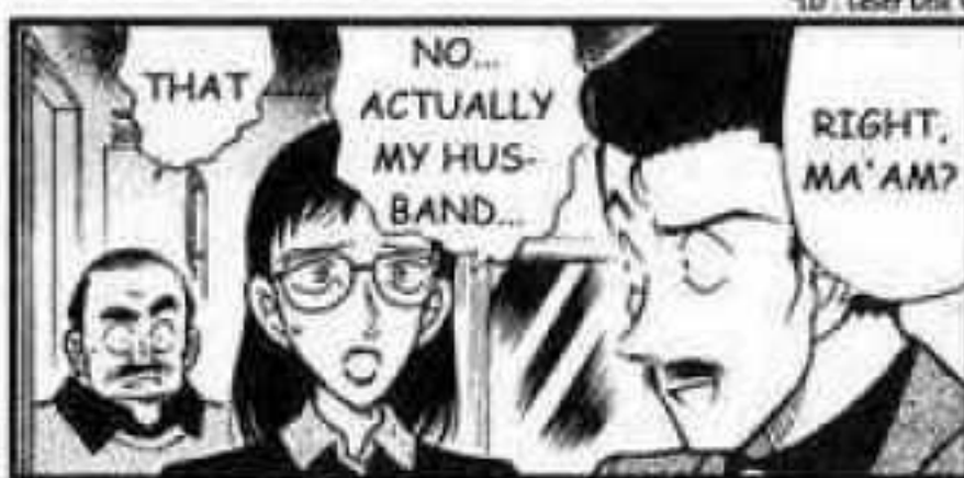
*LD : Laser Disk Video

OK THEN, TAKE A LOOK AT THE VIDEO RECORDER UNDER THE TV IN THE KITCHEN!