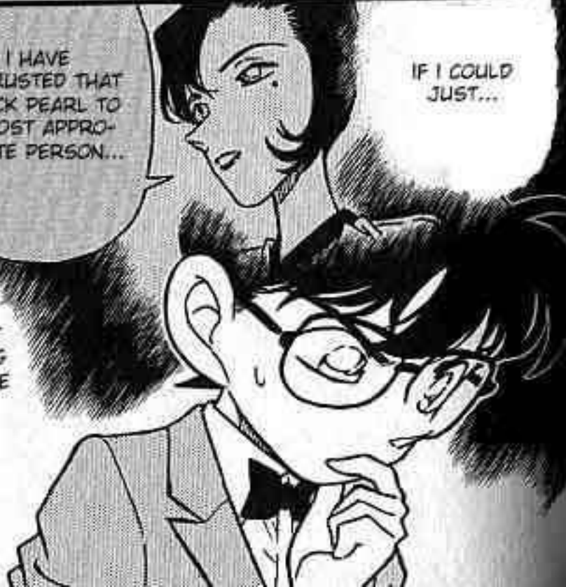
FIGURE OUT THE MEANING OF WHAT SHE WAS SAYING...